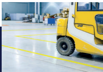
Withstands lifting from forklift traffic