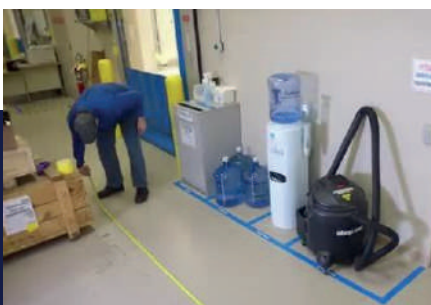
General marking applications

On the overleaf there is just a small selection of our most popular lane marking tapes. We offer many more products within this range. If you have a requirement you would like to discuss please contact your Area Sales Manager or nearest branch.